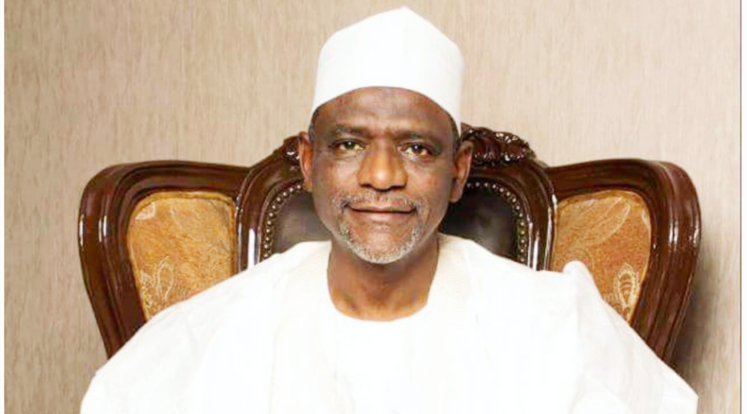
■ The Honourable Minister of Education, Malam Adamu Adamu

"Thanking Mum" by Adamu Adamu is a tribute to Hajia Fatima Adamu, the Mother of the Hon. Minister of Education, published on the back page of DailyTrust of Friday, 19th June, 2015. This tribute, which communicated deep meanings and understanding of the value of mothers in our lives is reproduced verbatim by JAMBULLETIN to serve as a lesson to all on how to appreciate mothers when they are still alive and not only after death. It also serves as a reminder on the need to be dutiful to mothers by